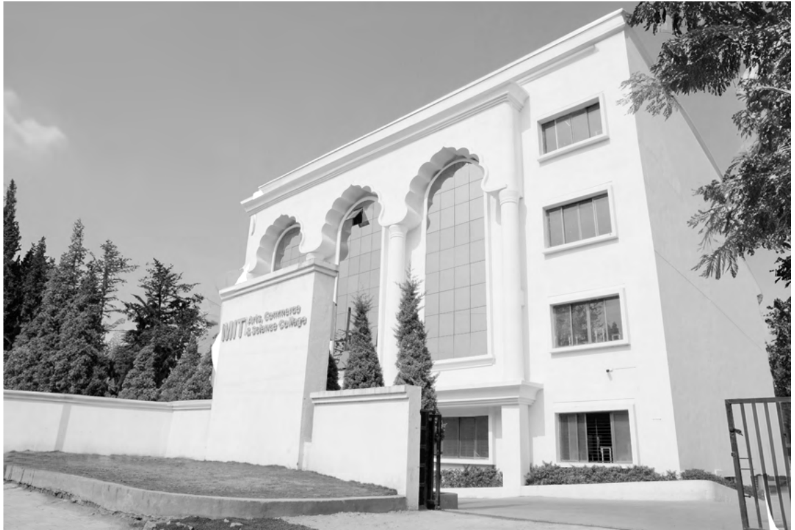
MIT Arts, Commerce & Science College, Moshi- Alandi Road, Alandi (D) - Pune. 412105